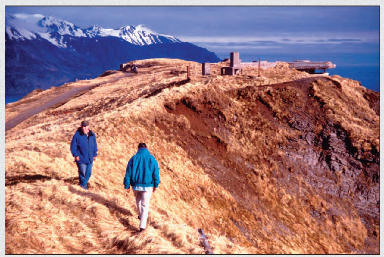
Ulakta Head and Command Center, Aleutian World War II National Historic Area.