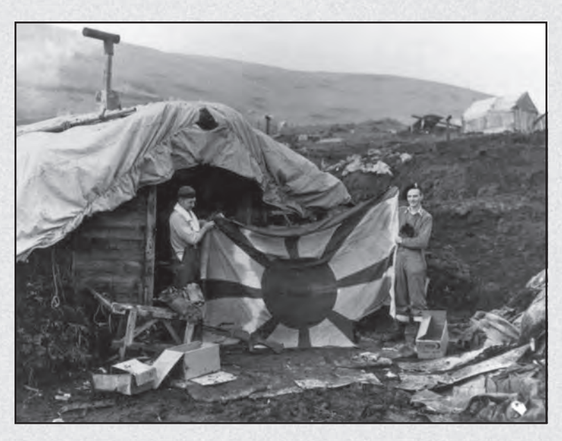
Canadian troops display a "Rising Sun" flag found on Kiska following the Japanese retreat from the island on July 28, 1943. The evacuation, which took place during stormy weather, went undetected by Allied forces who continue to bomb the island for nearly three weeks. On August 15, an invasion force of Canadian and American troops met only four weather and costly "friendly fire." (National Archives)

This photograph of Japanese pilots was developed from film recovered at Attu Island following the island's recapture by U.S. forces in May 1943. The battle to reclaim Attu was one of the bloodiest of the War in the Pacific. (National Archives)