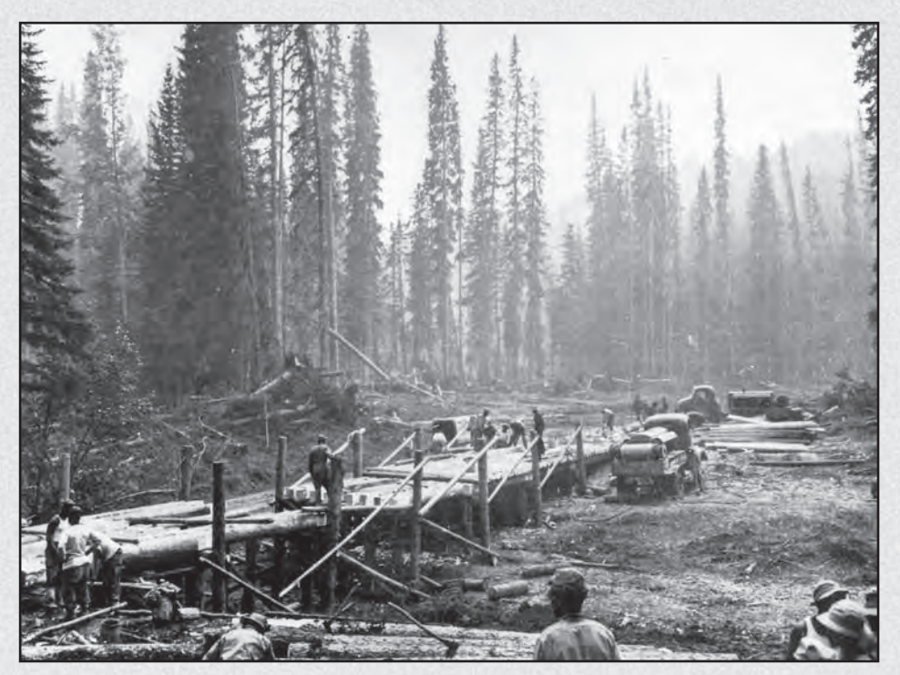
Black engineers build a trestle bridge during the construction of the Alaska Canada Military Highway. Black G.I.'s made up roughly forty percent of the estimated 11,500 Army troops who in just nine months completed a wilderness highway linking Alaska with the contiguous United States.