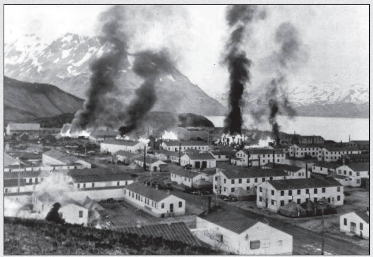
Buildings burn following the Japanese attack on the fort at Dutch Harbor, June 3, 1942. A second, more damaging attack came the next day, though the P-40 Aleutian Tigers scrambled to intercept the enemy from a secret base on Umnak Island.